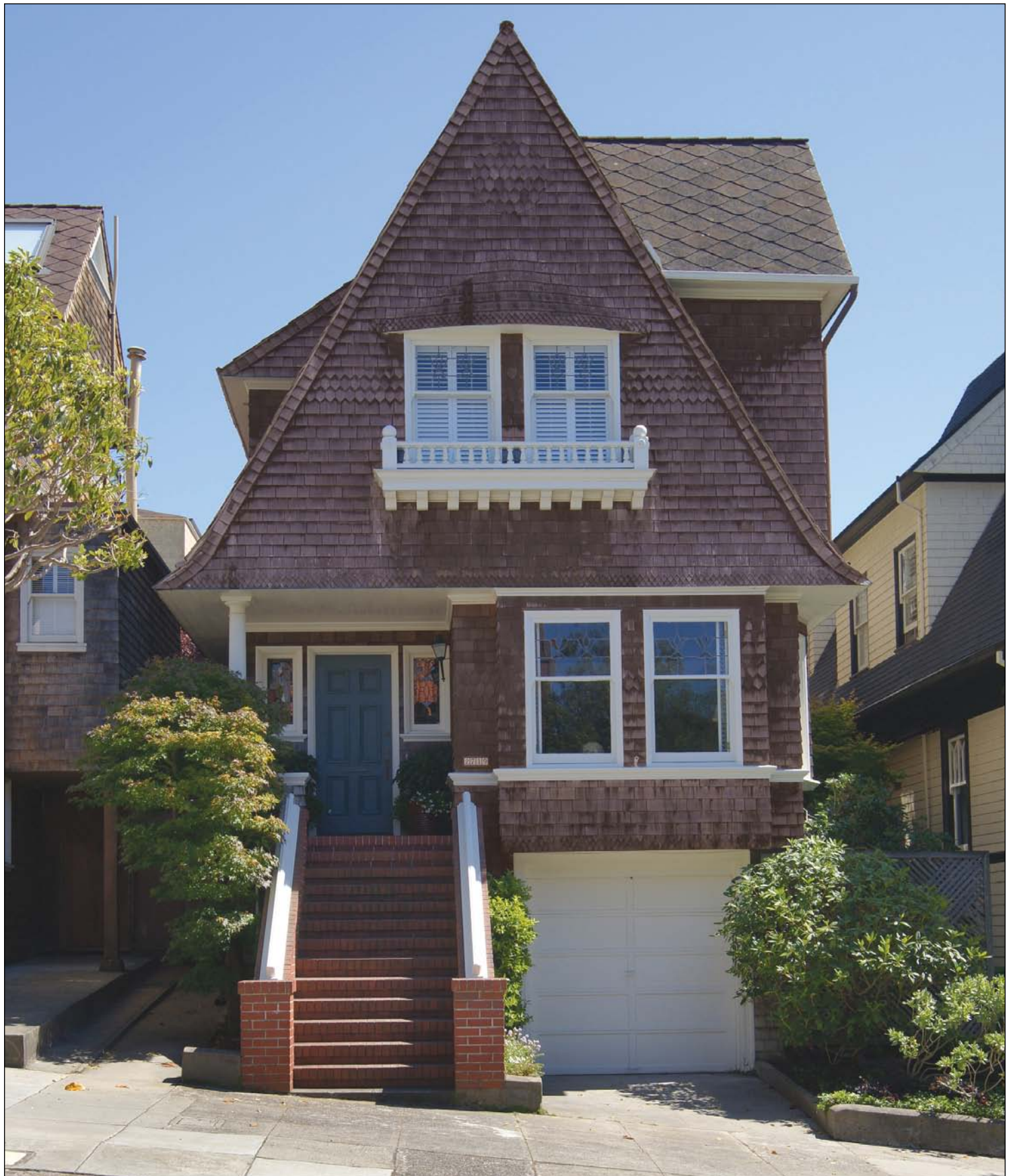
2719 FILBERT STREET, SAN FRANCISCO RENOVATED COW HOLLOW HOME WITH LOVELY GARDEN