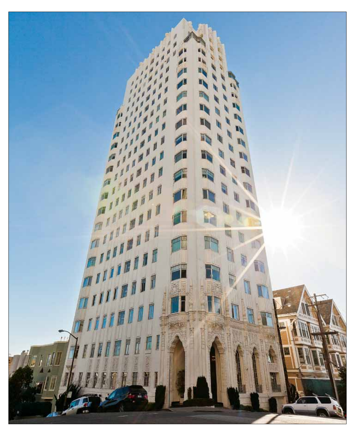
1101 GREEN STREET, 1001, SAN FRANCISCO RENOVATED RUSSIAN HILL CONDOMINIUM WITH MAGNIFICENT VIEWS