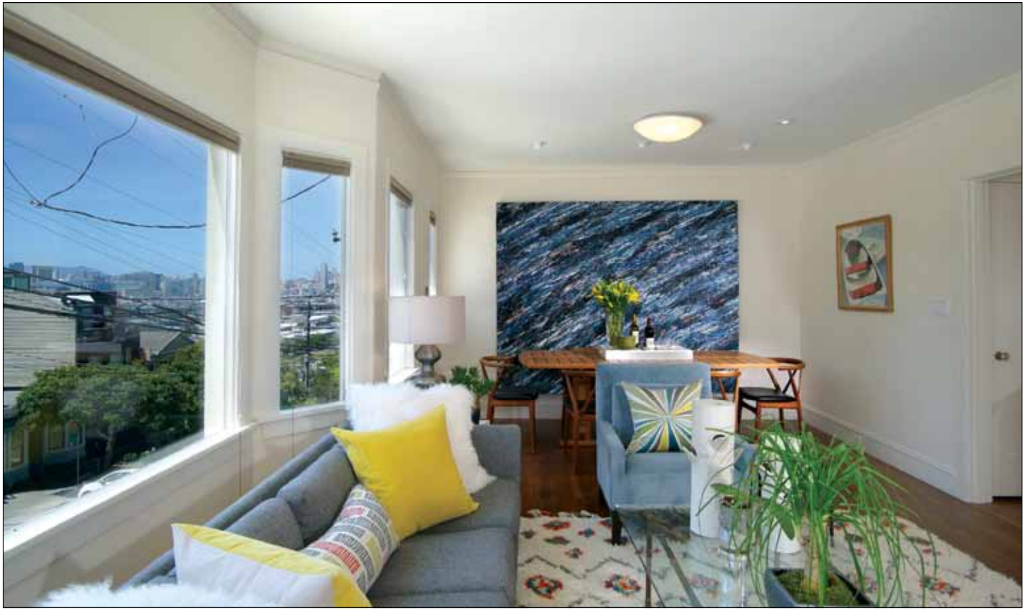
475 ARKANSAS STREET, SAN FRANCISCO SOPHISTICATION AT THE TOP OF POTRERO HILL