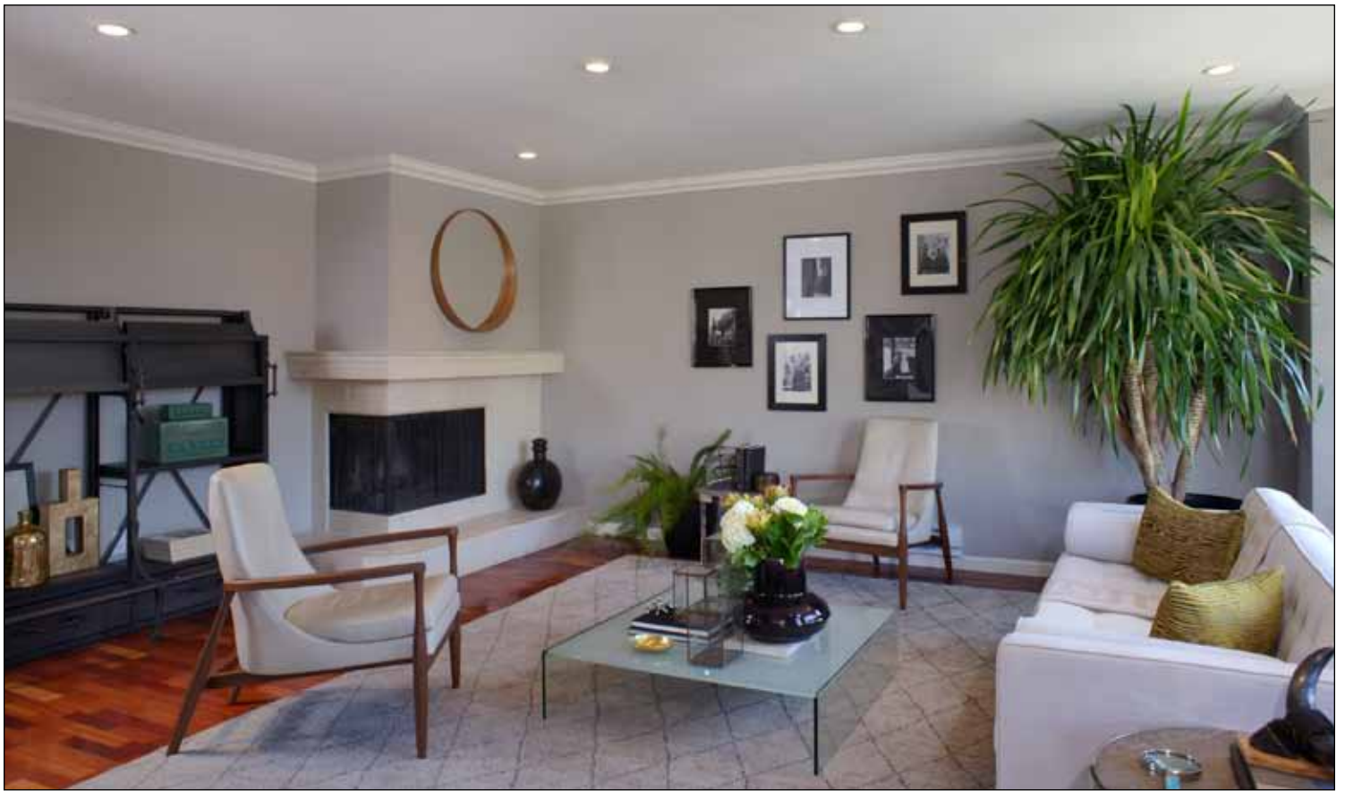
1982 SCOTT STREET, SAN FRANCISCO STYLISHLY REMODELED CONDOMINIUM IN LOWER PACIFIC HEIGHTS