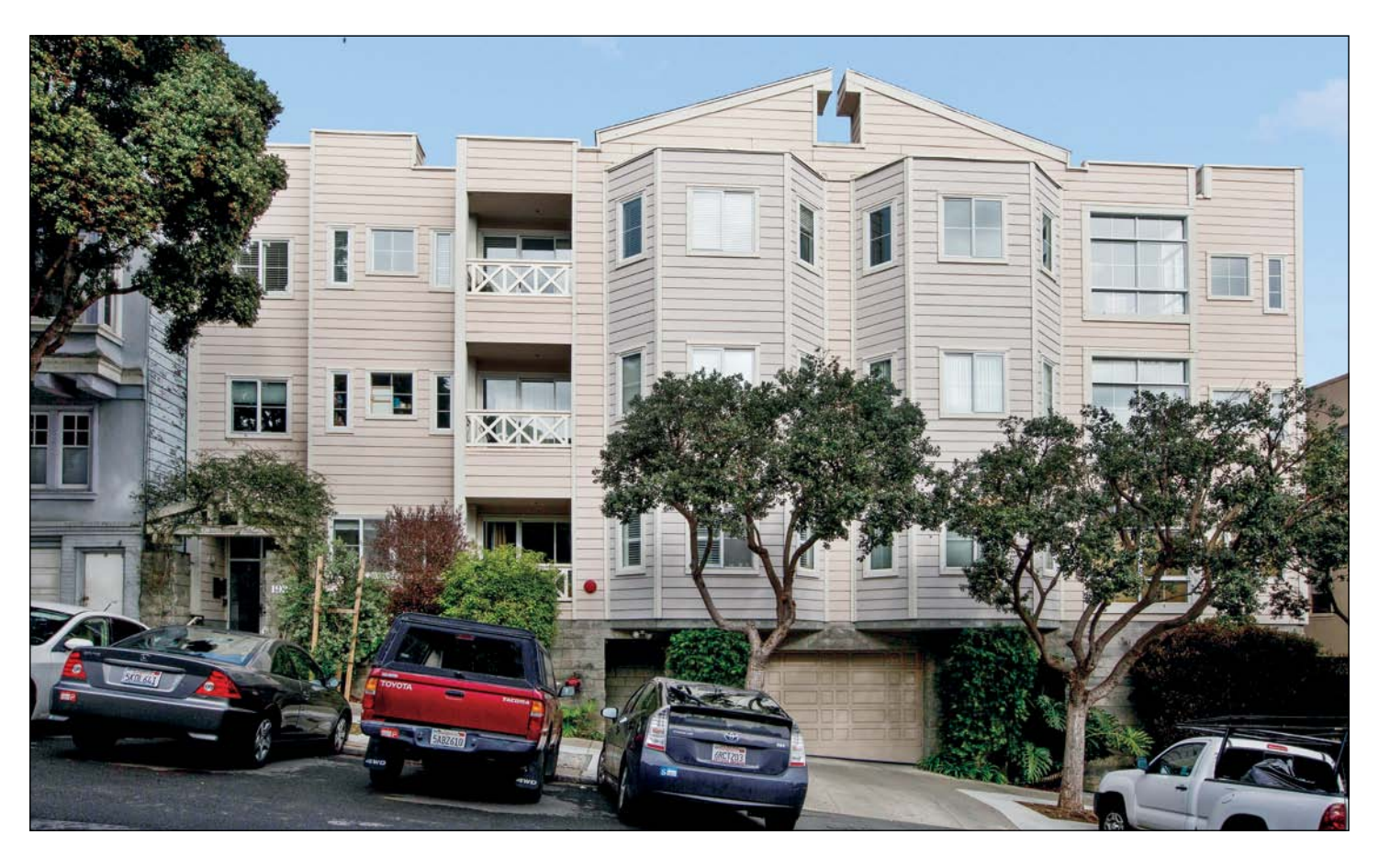
1930 EDDY STREET #302, SAN FRANCISCO STYLISH CONDOMINIUM WITH CITY VIEWS