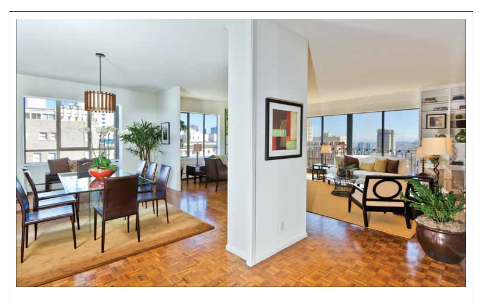
1170 SACRAMENTO STREET, 9B, SAN FRANCISCO STYLISH VIEW CONDOMINIUM AT THE TOP OF NOB HILL