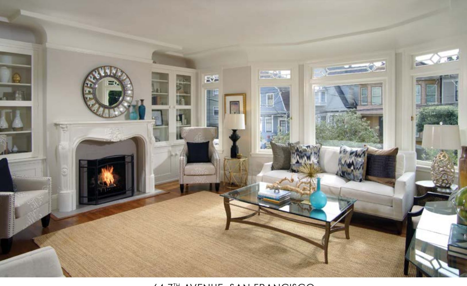
64 7<sup>th</sup> avenue, san francisco House-Like Condominium on Prime North of Lake Cul-De-Sac