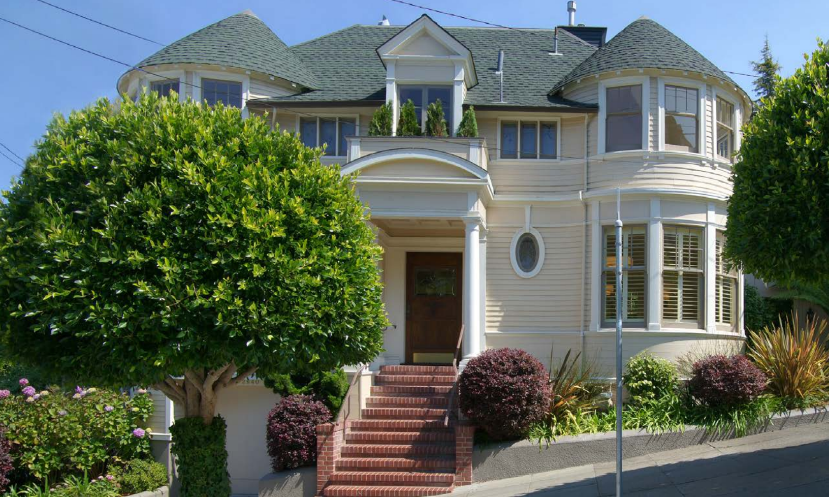
2640 STEINER STREET, SAN FRANCISCO STATELY PACIFIC HEIGHTS VICTORIAN