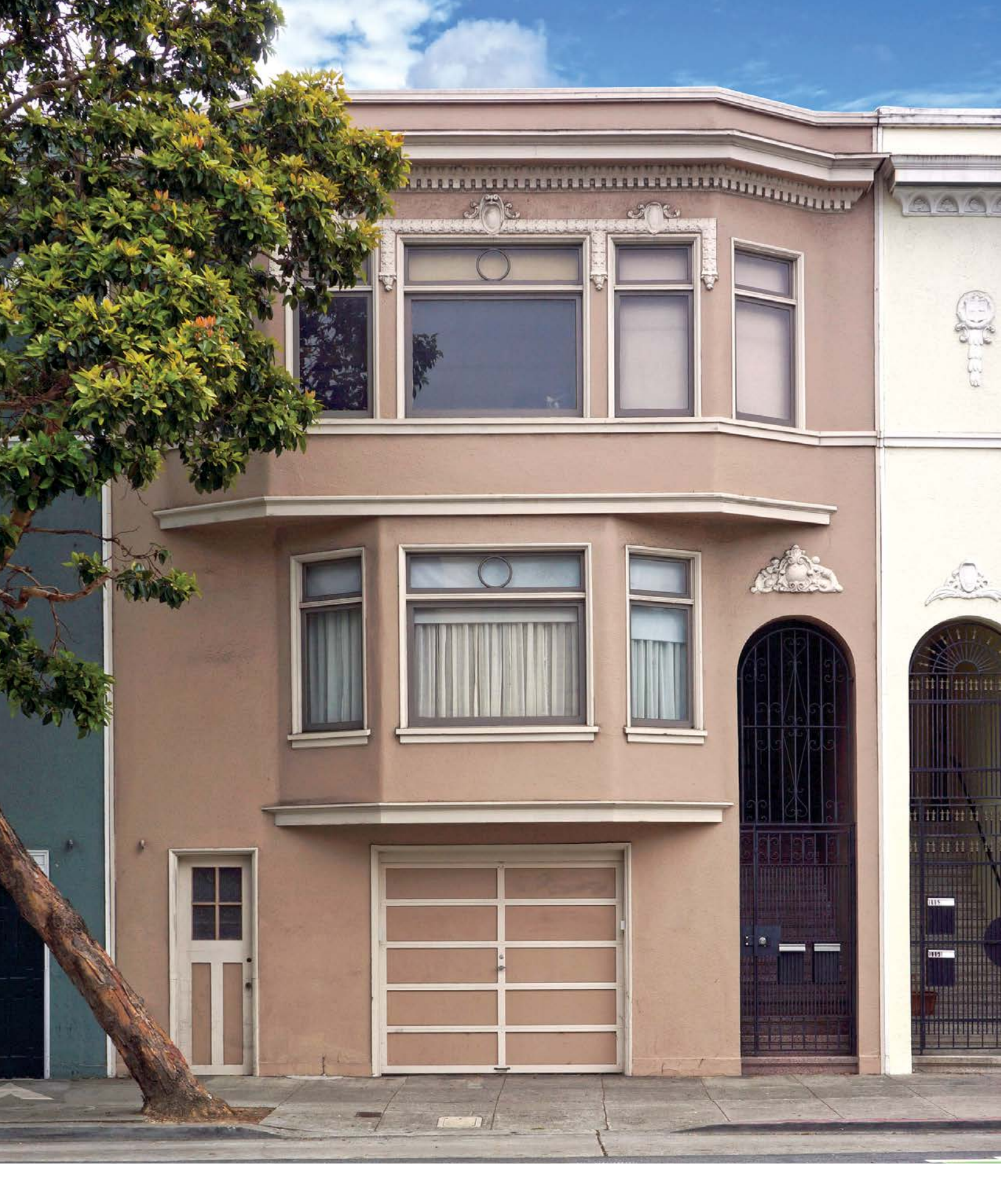
1147 & 1149 FELL STREET, SAN FRANCISCO SPACIOUS FLATS IN PRIME LOCATION