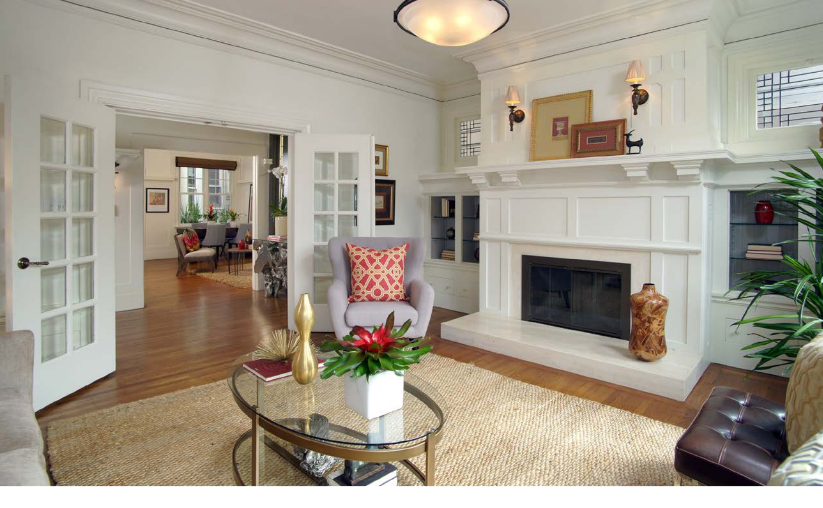
214 ARGUELLO BOULEVARD, SAN FRANCISCO CLASSIC PRESIDIO HEIGHTS EDWARDIAN FLAT