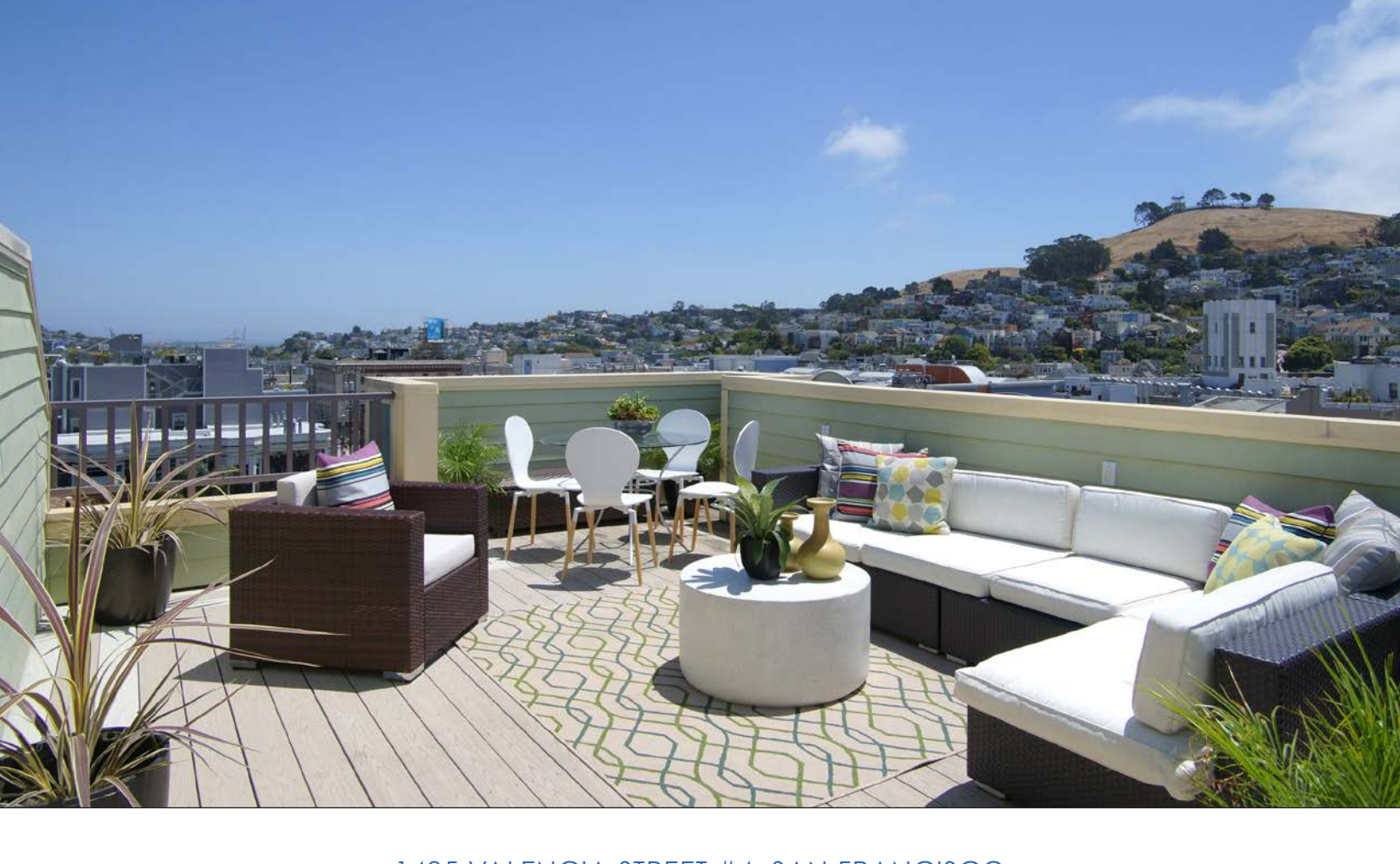
1495 VALENCIA STREET #4, SAN FRANCISCO CONTEMPORARY VIEW CONDOMINIUM WITH PRIVATE ROOFTOP DECK