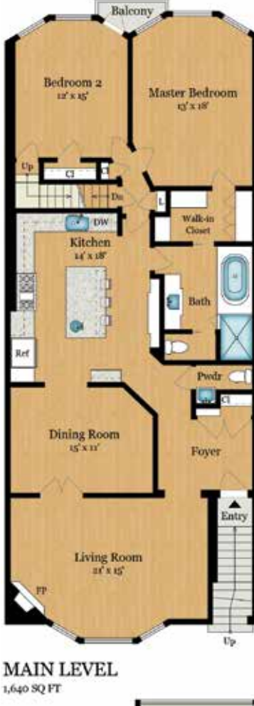
1,640 SQ FT Office/Play Room