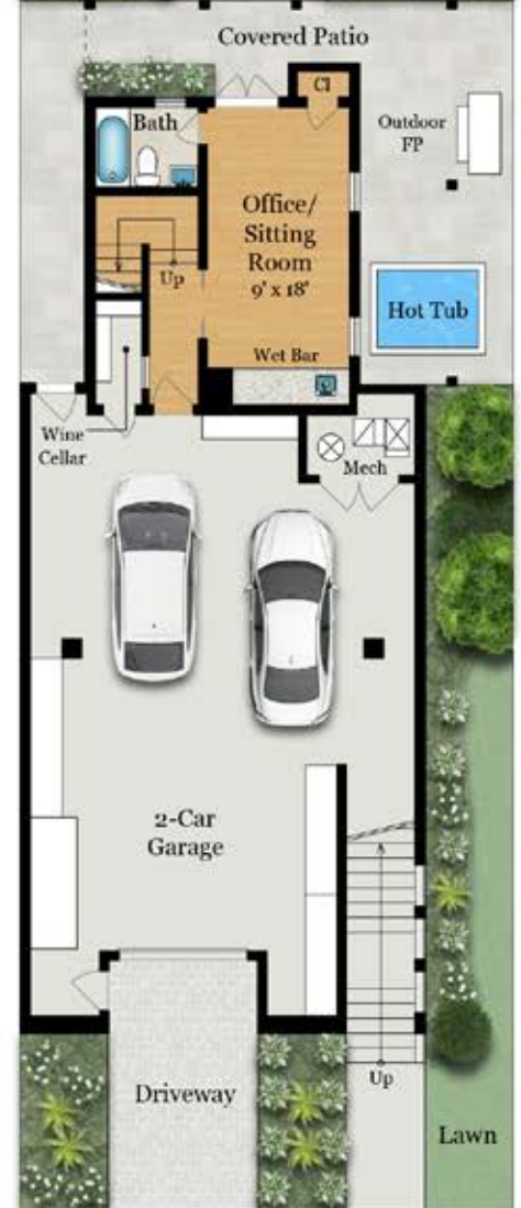
LOWER LEVEL Baker St 335 SQ FT - Finished / 885 SQ FT - Unfinished