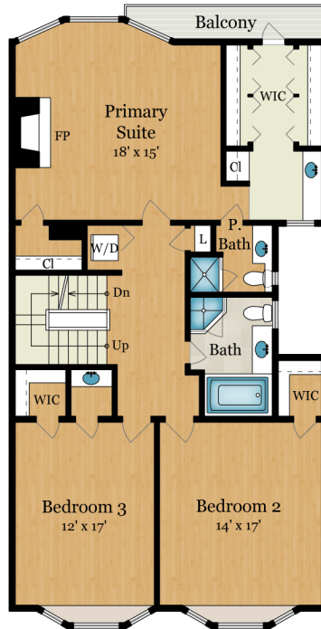
UPPER LEVEL 1 1,320 SQ FT