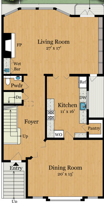
MAIN LEVEL 1,250 SQ FT