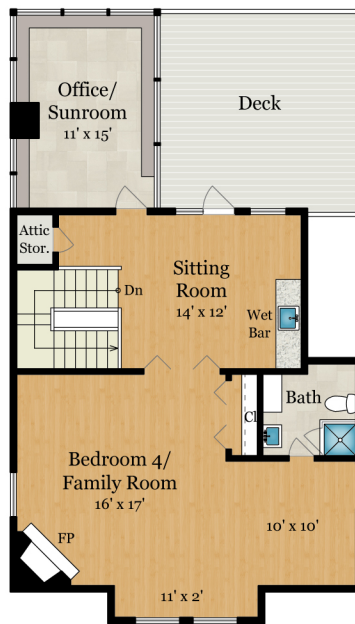
UPPER LEVEL 2 965 SQ FT