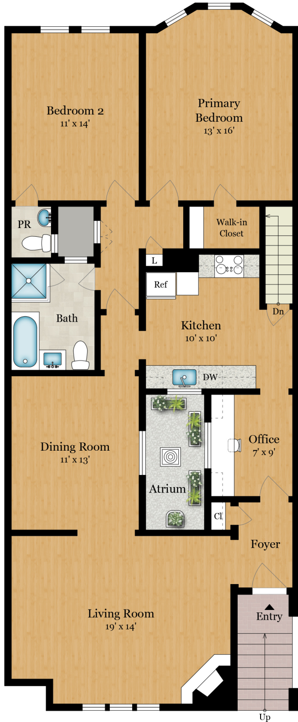
MAIN LEVEL 1,355 SQ FT

* Estimated Total Finished & Unfinished Square Footage: 2,745 SQ FT