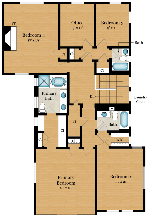
UPPER LEVEL 1,755 SQ FT